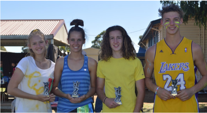
Under 16 Winners