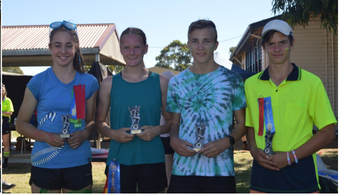
Under 15 Winners