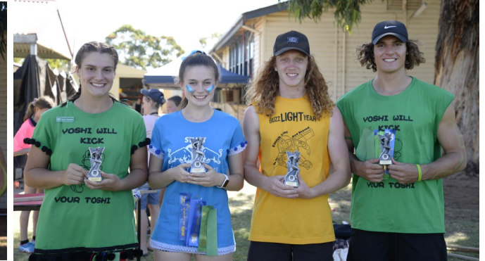
Under 21 Winners