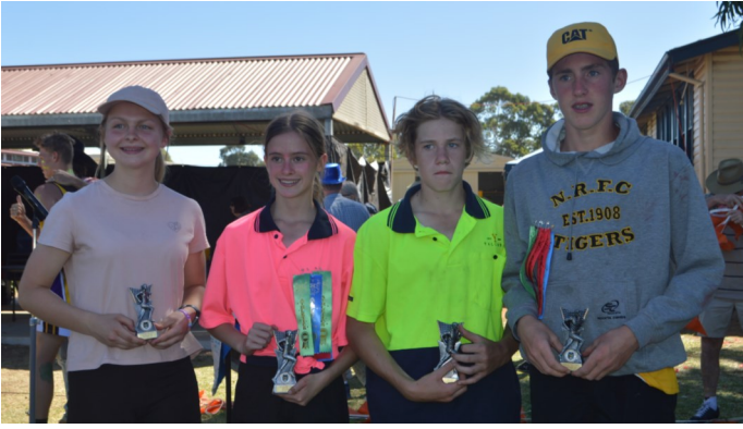
Under 14 Winners