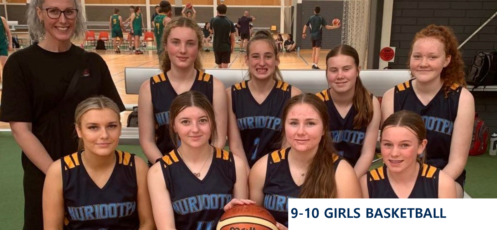
9-10 GIRLS BASKETBALL