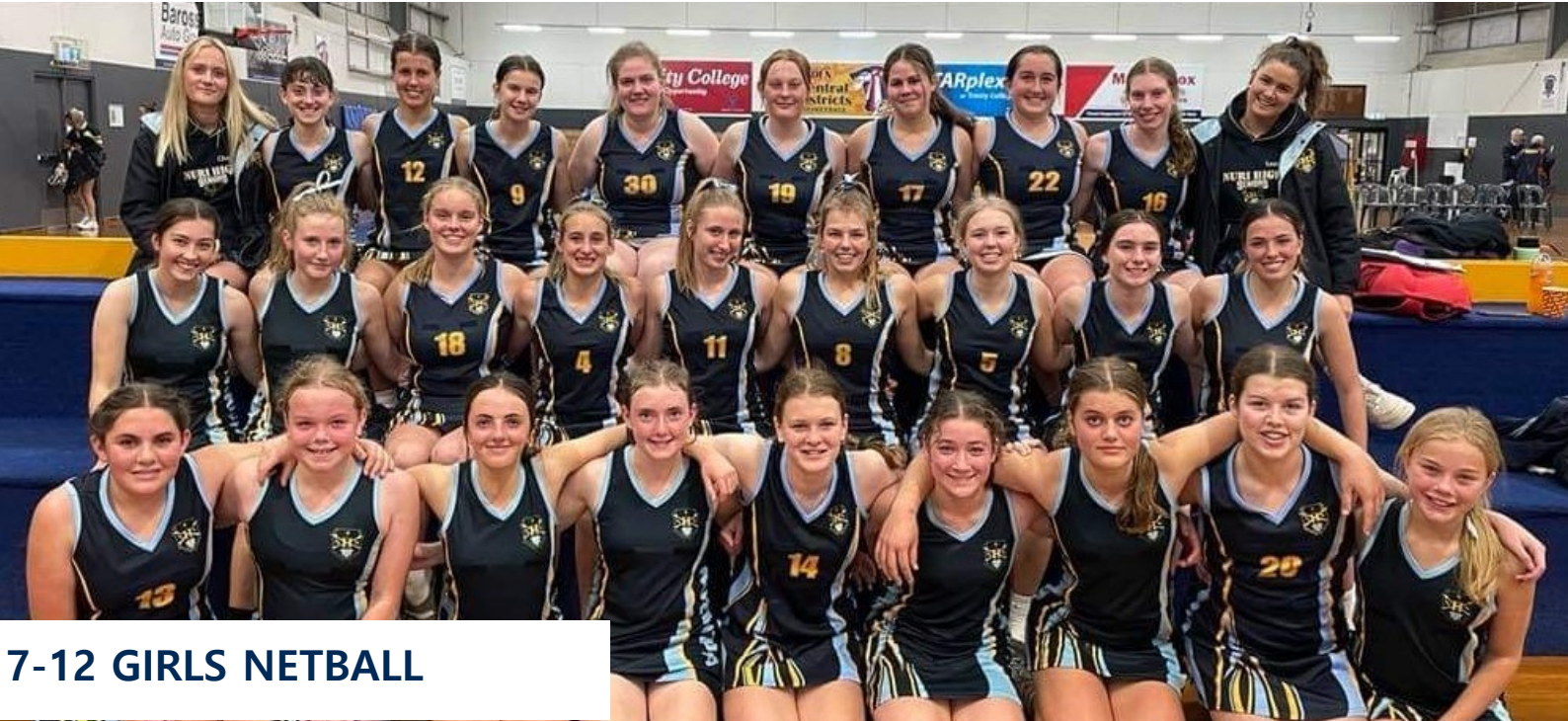
7-12 GIRLS NETBALL