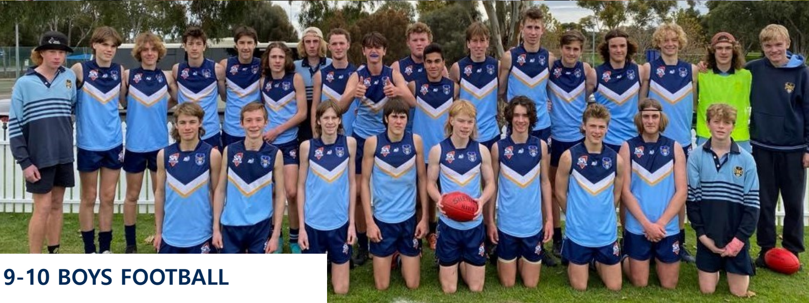
9-10 BOYS FOOTBALL