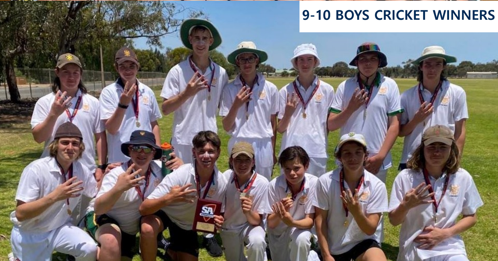
9-10 BOYS CRICKET WINNERS