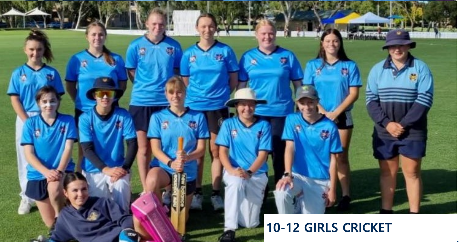
10-12 GIRLS CRICKET