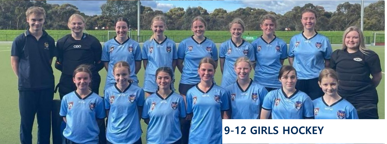
9-12 GIRLS HOCKEY