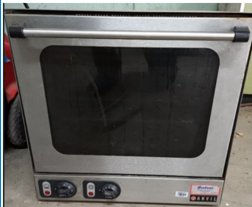
Oven - ex Canteen