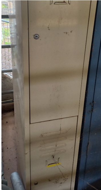
5 x 2 Door Metal lockers