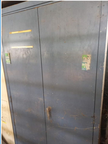
2 x Metal Double Door Cabinets with shelving